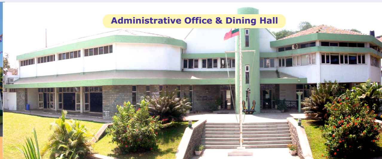
Administrative Office & Dining Hall